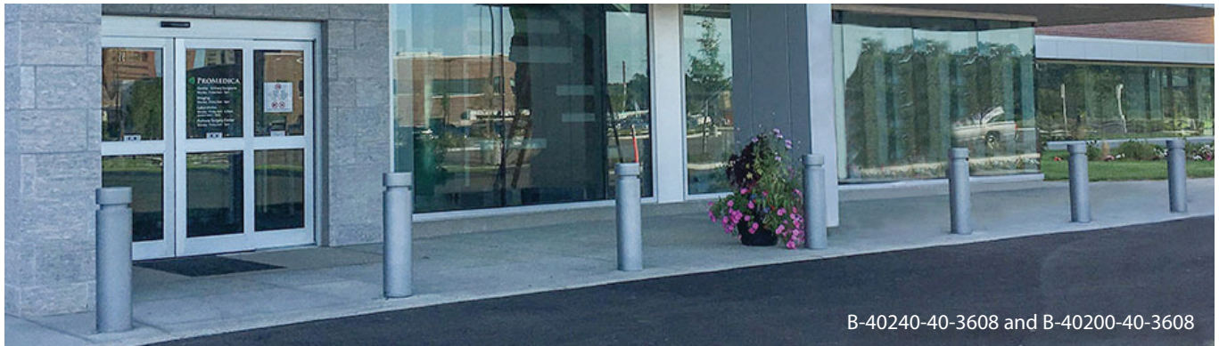
B-40240-40-3608 and B-40200-40-3608

Note: All heights listed in description are measured above grade. B-4 Bollards are available in 30", 36", 42" and 48" heights.